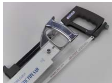
High Tension Hand Hack Saw Frames (Black) Packed 5 per box PVC /ABS Plastic Pipe Saw Handle (Silver) Packed 5 per box